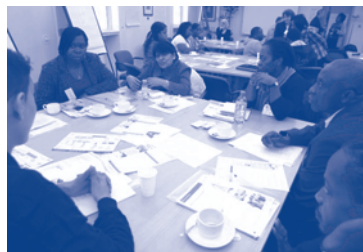
Working group taking the project forward