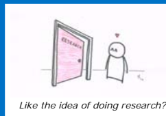
Like the idea of doing research?