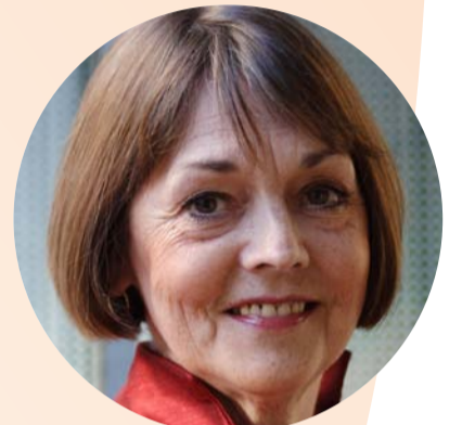
RCN President Maura Buchanan

RCN Council wishes you a great Congress! RCN Council