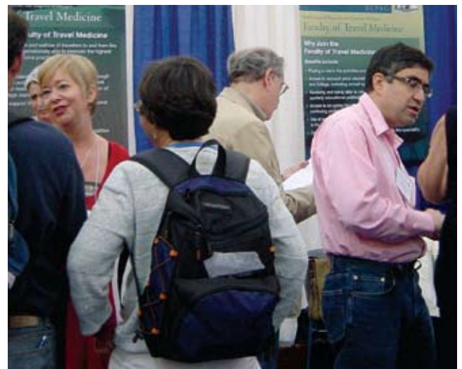
The exhibition provided a wealth of new information with the RCPSG Faculty of Travel Medicine stand well placed as a friendly meeting place for many

As with all major conferences it is often difficult to choose which sessions to attend,