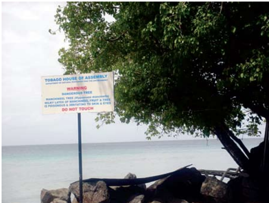
Beware of the tree, the sign warns it is highly poisonous!

in Tobago, although there are several flights a day to Trinidad which is only 40 minutes away. Those who did make the trip said that getting to and from the airport was the biggest hurdle as the roads were very congested.