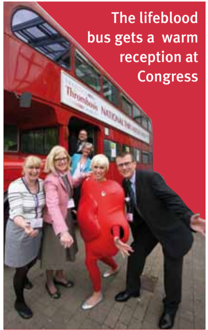
The lifeblood bus gets a warm reception at Congress

Kathleen closed the debate saying that nurses are advocates for the rights of young people and there should be equitable access to this preventative health care programme across all four countries of the UK.