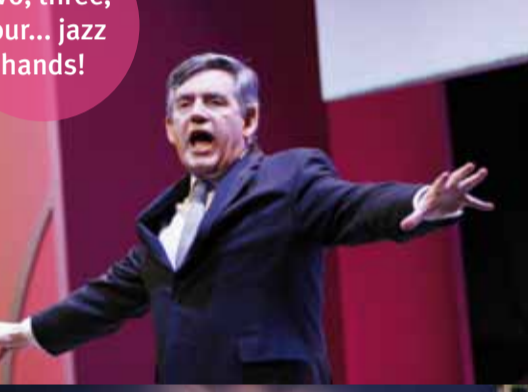
Two, three, four... jazz hands!