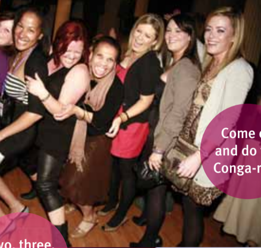
Come on and do the Conga-ress