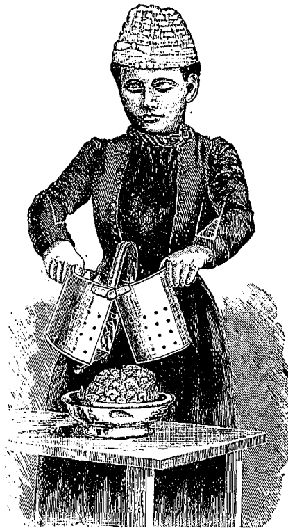
FIG. 3. Showing Vegetables being Transferred Whole into the Dish.

side the saucepan. After the vegetables are sufficiently boiled, the saucepan is taken from the fire and the strainer is then lifted out, allowing the water to drain away, as shown in Fig. 2, then the vegetables are placed into the dish, as shown in Fig. 3, by simply loosening the pin in the