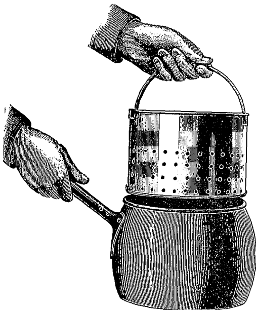
FIG. 2. Patent Vegetable Boiler being taken Out of Saucepan.

they had been mashed. Holmes's patent obviates all this. It is divided into two pieces, which are secured at the top by brass hinges; at the bottom it is locked by a very simple bolt, which enables it to divide when required. When needed for use, the strainer with the vegetables is placed in-