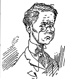
Our Book Reviewer.

"CRUSHES AND CROWDS in Theatres, and other Buildings, in cases of Fire or Fright.—