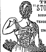
TEUFEL "STOOP-CURE" CORRECTS ROUND SHOULDERS, AND TENDENCY TO STOOPING UNOBSERVABLE. COMFORTABLE. EFFICIENT.