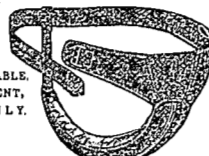
PREVENTS CHAFING AND CHILL. COMFORTABLE. EFFICIENT, CLEANLY.

SOLD BY SURGICAL INSTRUMENT MAKERS, CHEMISTS, LADIES' OUTFITTERS, &c For ILLUSTRATED CATALOGUE Apply to TEUFEL REMEDIAL APPLIANCES CO.