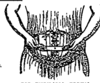
FOR UMBILICAL HERNIA