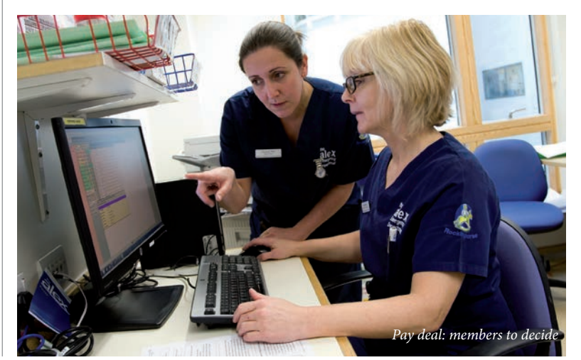
Get the latest news on pay at www.rcn.org.uk/whatif

Meanwhile, the RCN What if...? campaign to defend pay and conditions will continue. Members in selected NHS workplaces in England and Northern Ireland are being encouraged and assisted to seek time off in lieu or payment for excess hours worked.