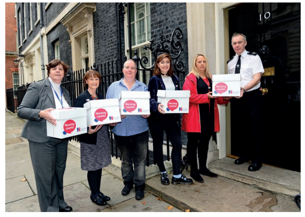
RCN pay champions hand a petition of 67,000 names to Downing Street, opposing the Government's policy on public sector pay, following a successful summer of protest demanding the pay cap is scrapped.