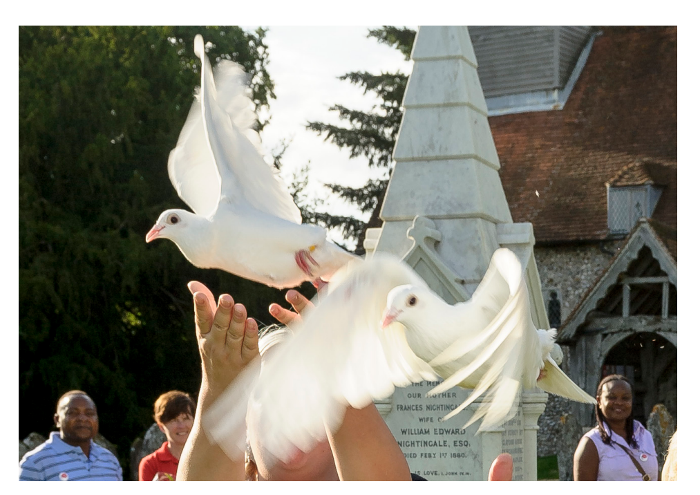
Members release doves at a Scrap the Cap vigil by Florence Nightingale's grave in West Wellow, Hampshire. Find out more about Scrap the Cap at <a href="http://www.rcn.org.uk/scrapthecap">www.rcn.org.uk/scrapthecap</a>