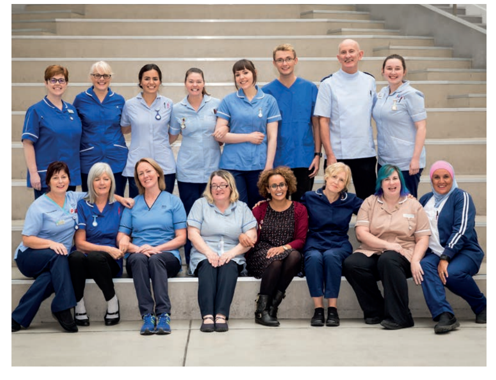
Some of the RCN's dedicated and diverse members were recently filmed sharing their experiences of what being a member means to them. Find out more at <a href="https://www.rcn.org.uk/membership">www.rcn.org.uk/membership</a>