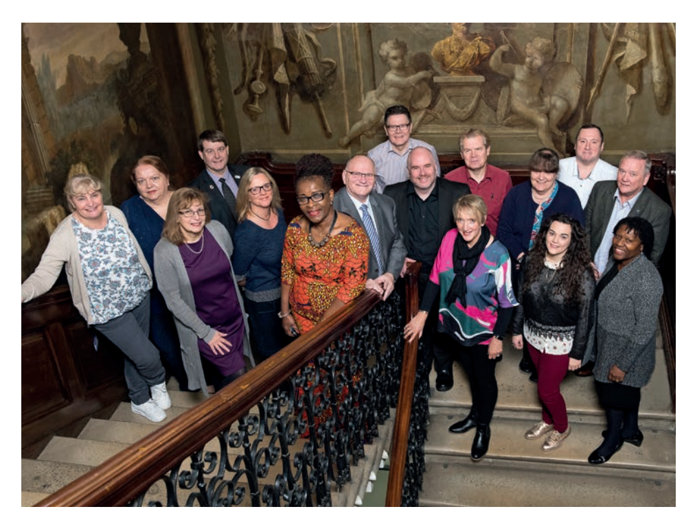
Members of the new, streamlined, RCN Council met for the first time in January. To find out more about Council's role and what was discussed, visit www.rcn.org.uk/governance