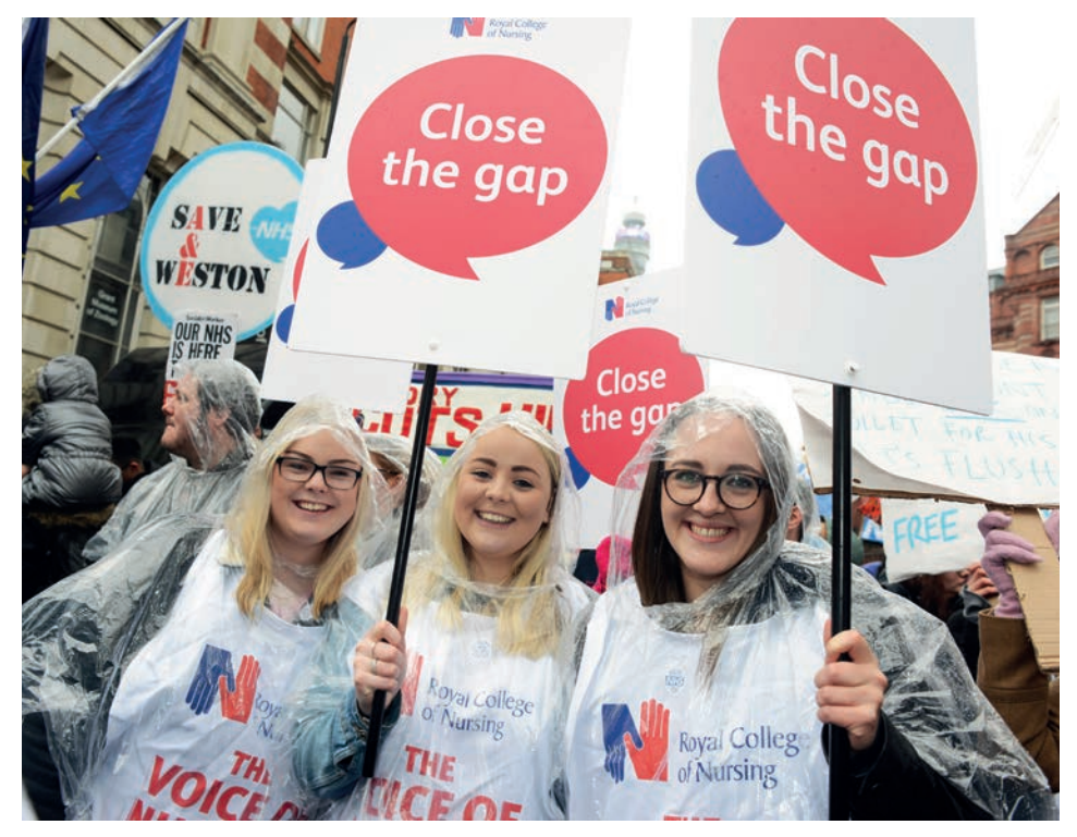
RCN members braved the rain to join thousands in a march to save the NHS in London. They attended as part of the Close the Gap pay campaign. Visit <a href="https://www.rcn.org.uk/closethegap">www.rcn.org.uk/closethegap</a>