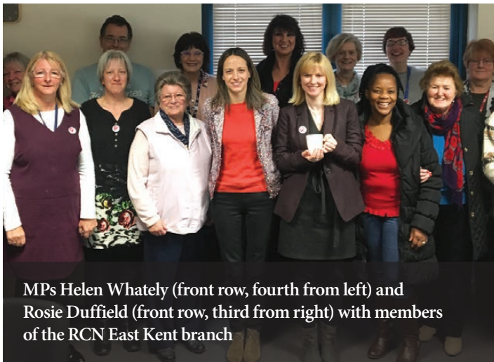
MPs Helen Whately (front row, fourth from left) and Rosie Duffield (front row, third from right) with members of the RCN East Kent branch