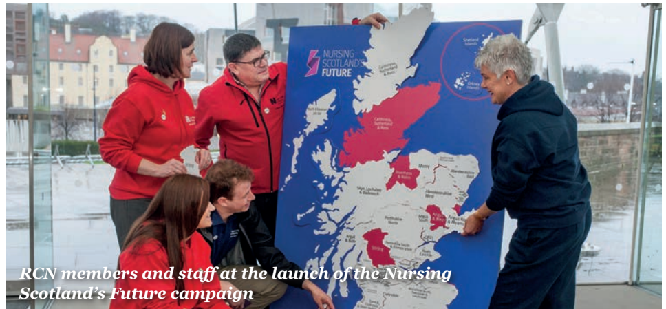
RCN members and staff at the launch of the Nursing Scotland's Future campaign

While there are many shared issues – whether ensuring safe staffing, valuing the contribution of nursing staff or focusing on the longer term – every country faces unique challenges.