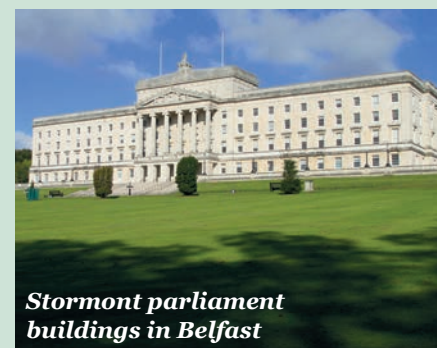
Stormont parliament buildings in Belfast