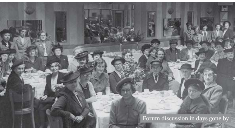
Forum discussion in days gone by

Originally developed to ensure the member voice was heard on specialist nursing issues and promote professional leadership, the RCN forums continue to be central to the work of the College.