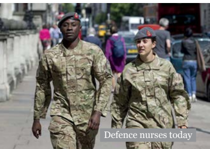
Defence nurses today

As the RCN celebrates its centenary, we reflect on how much times have changed. But there are still threads of history so relevant today. Defence nurses are still risking their