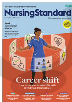
Vol. 37 issue 2