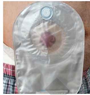
A stoma

Gastroenterology nurses adopt a multidisciplinary and multiagency approach to planning treatment and care. Clinical placements offer the opportunity to work with a wide team, including gastroenterology consultants, physiotherapists, radiotherapists, occupational therapists, speech and language therapists, dieticians, nursing support workers, and social workers.