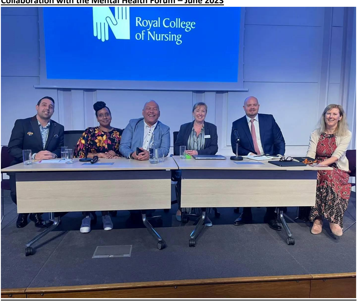
Best Practice March 2023

Collaboration with the Mental Health Forum – June 2023