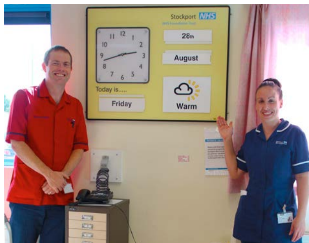
Dementia Orientation Board