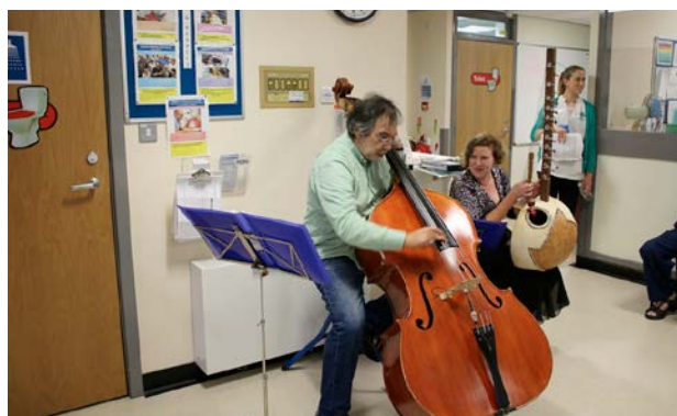
Music in Hospitals

Music in Hospitals have visited the hospital to perform for the patients. Patients form a connection with music and staff see a very different side to them. Music can help with reminiscence and relaxation. It also helps patients make positive connections with others as it triggers memories. All wards now have CD players and CDs to help relieve anxiety in patients living with a diagnosis of dementia.