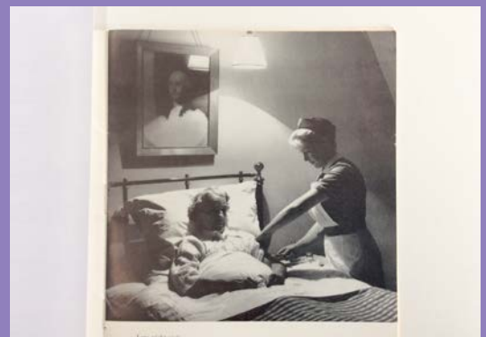
General nursing care