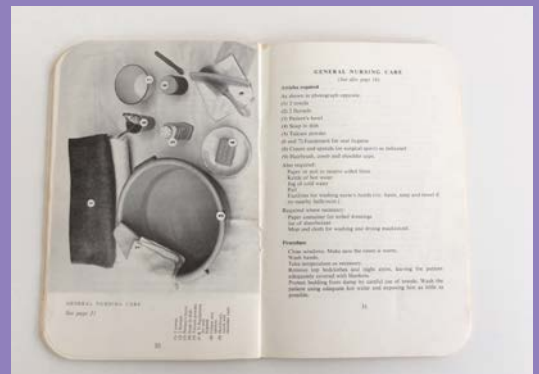
Late night visit

"We collected our uniforms for the same depot as the bus drivers."